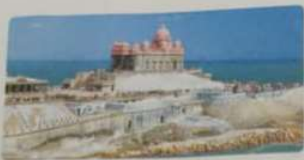
This is the famous Vivekananda Rock Memorial at Kanniyakumari (Tamil Nadu).

mainland of India. However, the southernmost tip of the country is