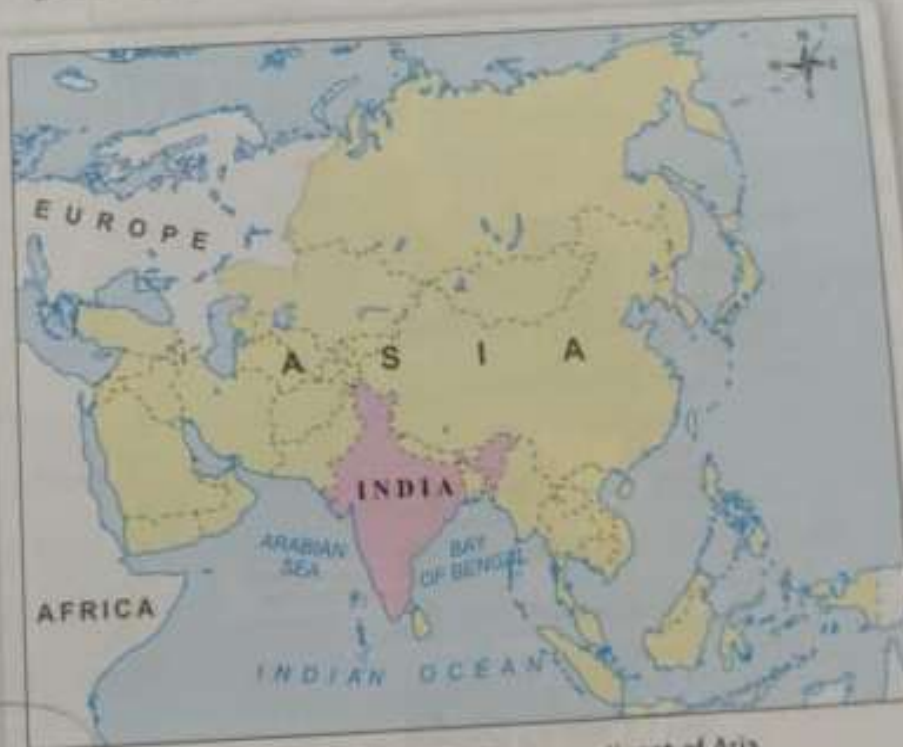
Map 1.1 India is located in the continent of Asia.

Arabian Sea in the west, the Bay of Bengal in the east and the Indian Ocean